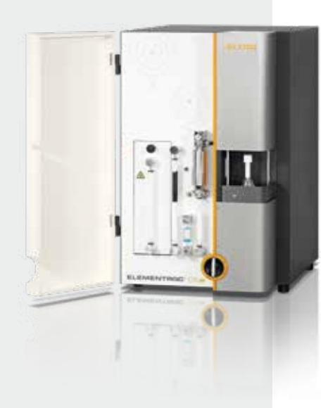
Fig. 3: ELEMENTRAC CS-i with induction furnace

This parameter can be easily determined with elemental analyzers. The standard stipulates the use of an analyzer with resistance furnace and infrared detection; however the direct determination is limited (chapter 6.4.1). As the upper limit for the free carbon content is given with 2%, analysis solely by combustion, for example of the Euronorm standard CRM 781-1 with an informative value of 37.22% is not permitted. Thus, characterization of free carbon by direct combustion is practically limited to pure silicon carbide. To measure very low concentrations, the standard specifies the use of a quartz tube (as is used, for example, in Eltra's CW-800M analyzer). The analyzer described in chapter 3.1 of this article is not suitable for this