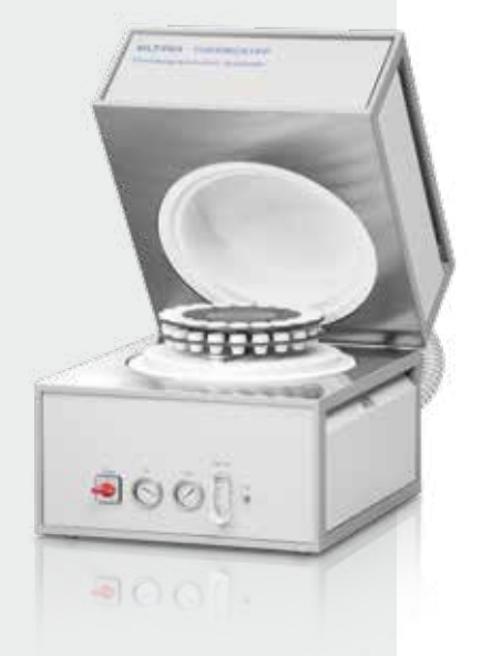
Fig. 1: ELTRA's thermogravimetric analyzer Thermostep

Fig. 2: Typical measurement curve Loss On Ignition (LOI)